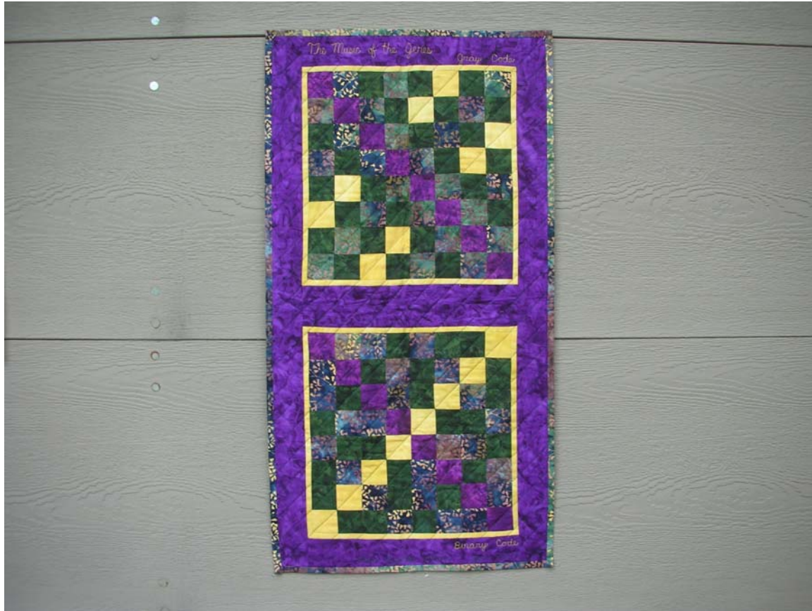
Figure 2c. “The Music of the Genes”. A quilt pattern by Elaine Ellison.

Notice that in M_2 the natural numbers 4,6,9 appear while in M_3 the natural numbers 8, 12,18, 27 appear, with each row and column having the same sequence of positive integers with no integer appearing adjacent to itself in a row or column. These sequences come from a triangle of numbers attributed to the 2 nd century AD Syrian mathematician Nicomachus (Kappraff, 2000) and represent successive sequences of musical fifths. The Nicomachus Triangle, T(n,k) , is reproduced in Table 1 where the integers in the n -th row are \{2^{n-k}3^k, 0 \leq k \leq n\}; n \geq 0 . Here if the central integer 6 is thought to be the length of a string representing a fundamental tone, then 4 and 9 of row 3 represent the string lengths corresponding to rising and falling musical fifths, ratios of 2:3 and 3:2. Also the fifth row represents the string lengths that give rise to a pentatonic